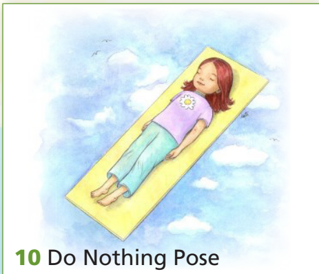
10 Do Nothing Pose